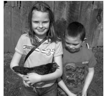
Holding the friendly chickens is a favorite part of a Poplar Spring tour