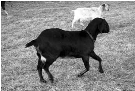
Juniper now enjoys running and playing with her friends.

There, for the first time in almost a year, Juniper had a warm dry bed of fresh straw, and all the timothy hay she could eat. She eagerly began munching on the hay, but she was soon exhausted from her long trip and wanted to sleep. I stroked her neck, and told her she was home now, and she sighed and laid her head in my lap. She seemed to understand that her days of pain and loneliness were finally over.