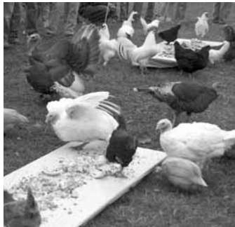
Chickens and Turkeys alike enjoy our Thanksgiving with the Turkeys

This year we again offered educational tours to thousands of visitors. Many groups and individuals volunteered, sponsored, and helped to care for the more than 200 animals that call the sanctuary home – thank you to everyone who gave their time and talents – we could not do it without you! Girl scouts from Troop 2261 working on their Bronze Award project collected and fed pumpkins to the very