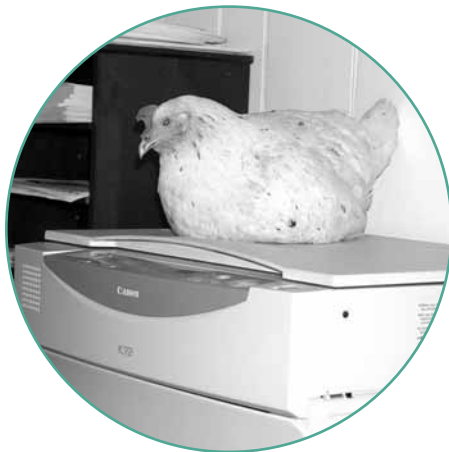
Belinda the "office chicken" in her favorite spot