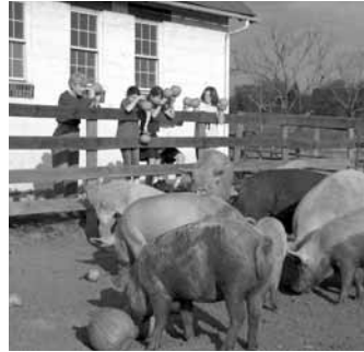
Girl Scouts collected and fed pumpkins to the pigs

our giant yard sale, hayrides and refreshments. In September, our 7th annual